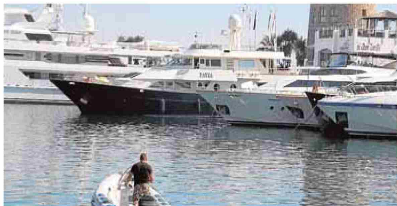
Puerto Banús welcomes more large yachts this summer.