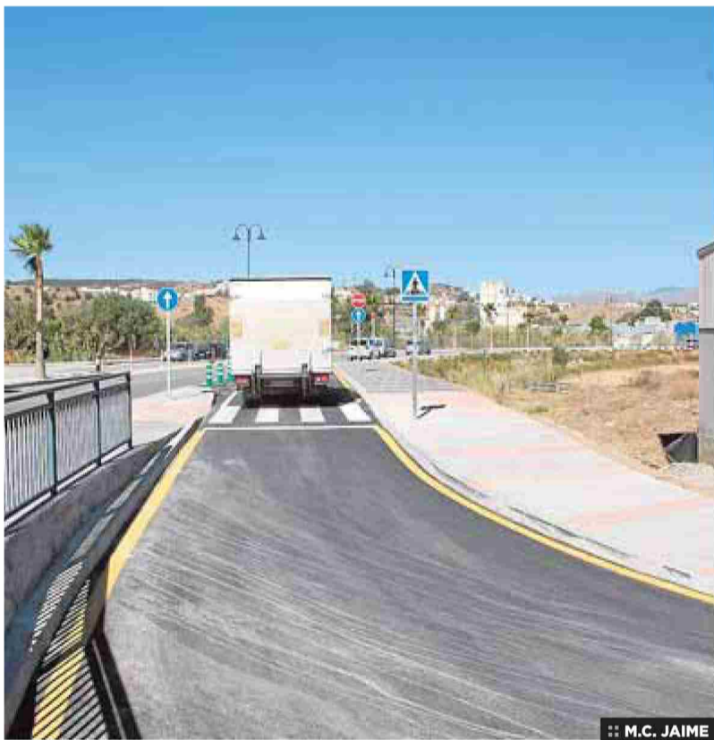
:: M.C. JAIME

The well-known Camino de Coín in Las Lagunas (A7053) has always been a concern when it comes to the volume of traffic on the road. Public service headquarters that are located on the route together with its links to main industrial areas, namely La Vega and Los Perales, has stimulated the creation of two new road links to relieve congestion. The new route can only be accessed via the Camino de Coín and exited by the new connection, avoiding heavy goods traffic that continue to use the current road. The works have been carried out by Fuengitrans, and received a municipal investment of around 100,000 euros.