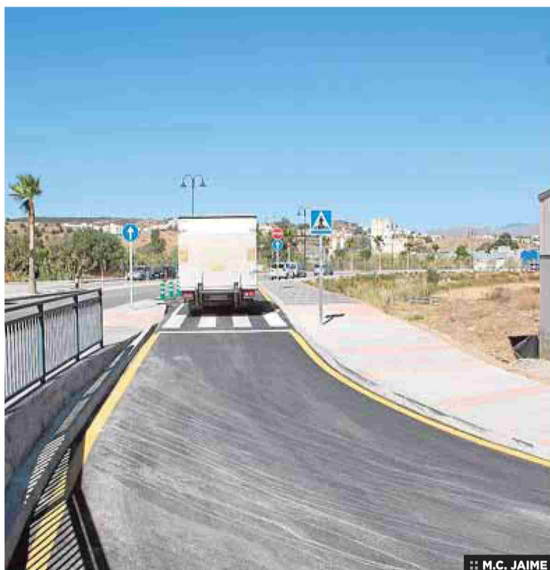
:: M.C. JAIME

The well-known Camino de Coín in Las Lagunas (A7053) has always been a concern when it comes to the volume of traffic on the road. Public service headquarters that are located on the route together with its links to main industrial areas, namely La Vega and Los Perales, has stimulated the creation of two new road links to relieve congestion. The new route can only be accessed via the Camino de Coín and exited by the new connection, avoiding heavy goods traffic that continue to use the current road. The works have been carried out by Fuengitrans, and received a municipal investment of around 100,000 euros.