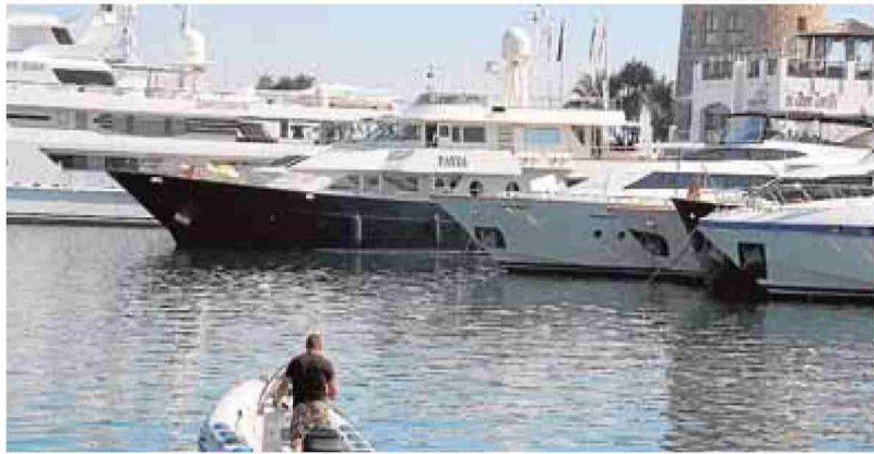
Puerto Banús welcomes more large yachts this summer.